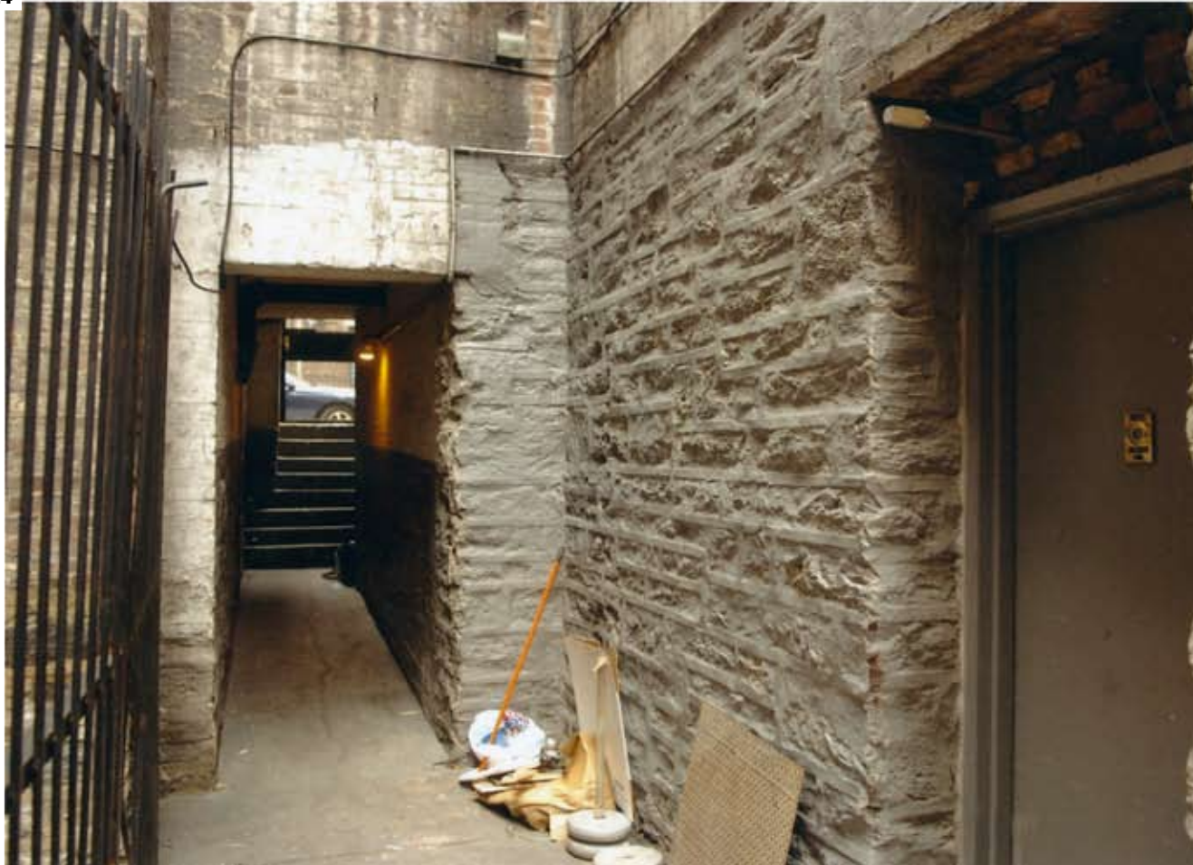
RAPE NEW YORK Affective and Legal Documents 10-12-2006