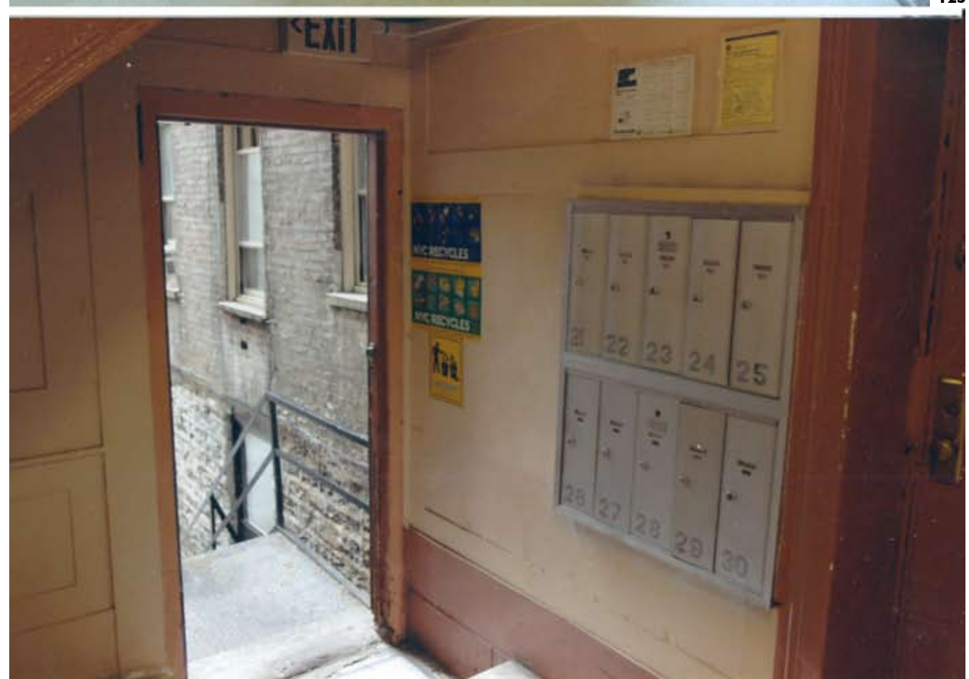
RAPE NEW YORK Affective and Legal Documents 10-12-2006