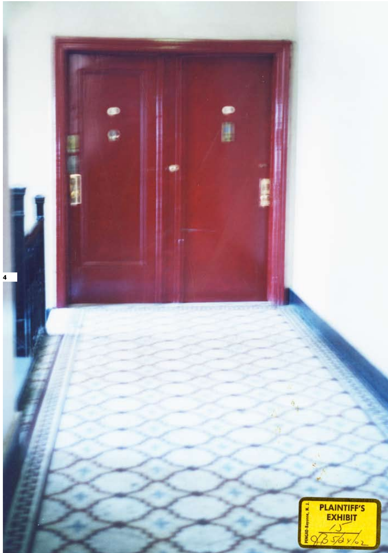
RAPE NEW YORK Affective and Legal Documents 1-26-2001