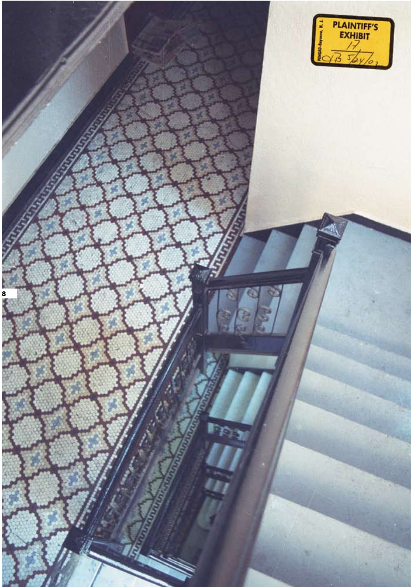
RAPE NEW YORK Affective and Legal Documents 1-26-2001