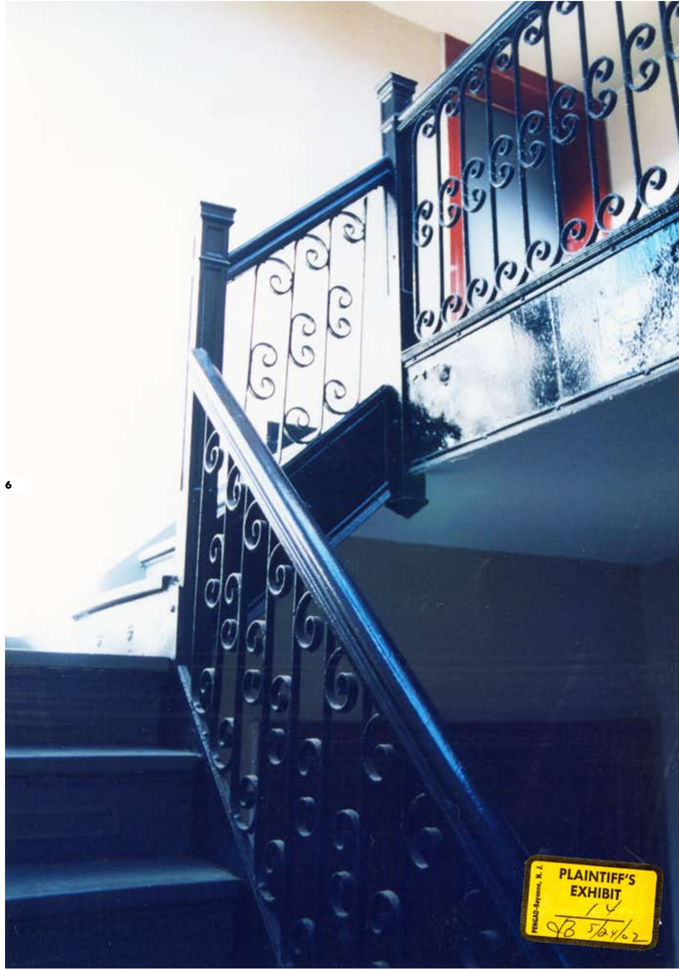
RAPE NEW YORK Affective and Legal Documents 1-26-2001