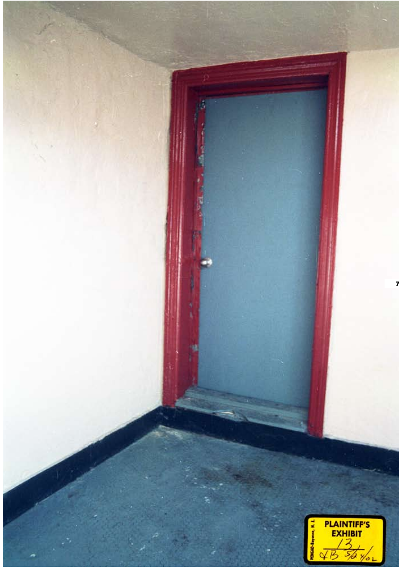
RAPE NEW YORK Affective and Legal Documents 1-26-2001