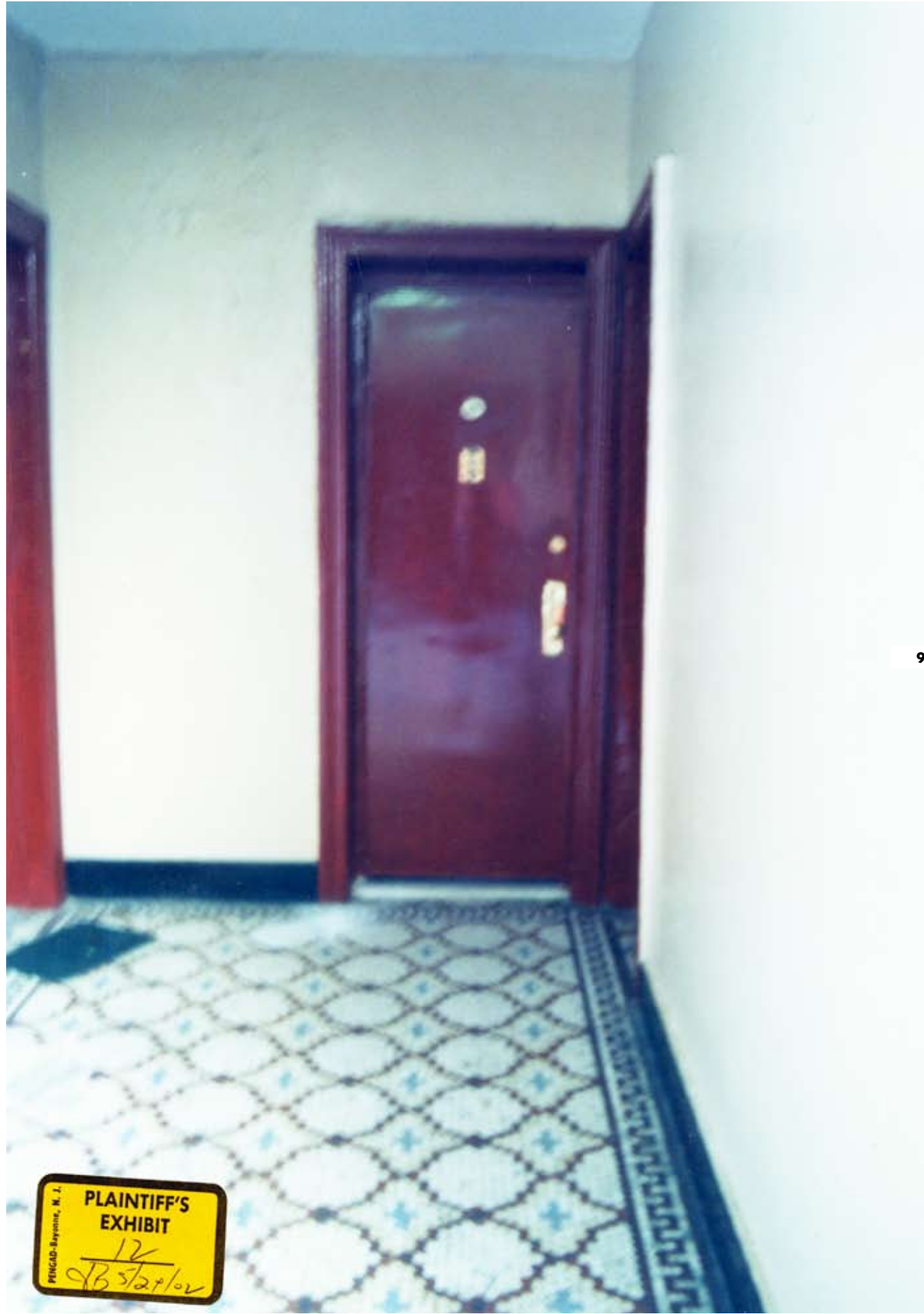
RAPE NEW YORK Affective and Legal Documents 1-26-2001